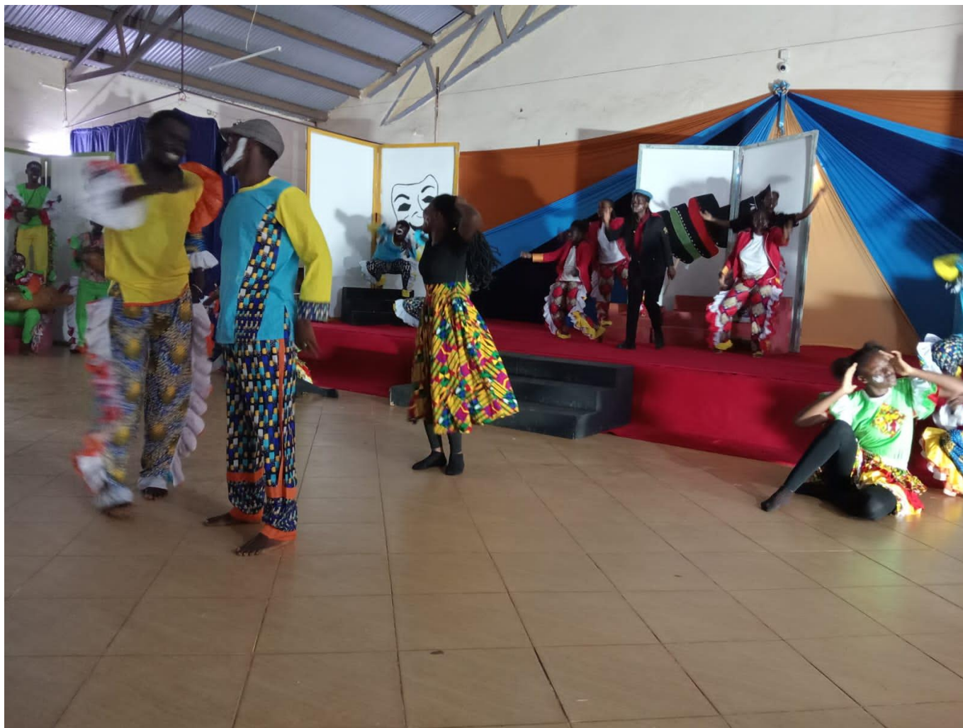
Cultural dance by MMUST during the western region FESTIVALS