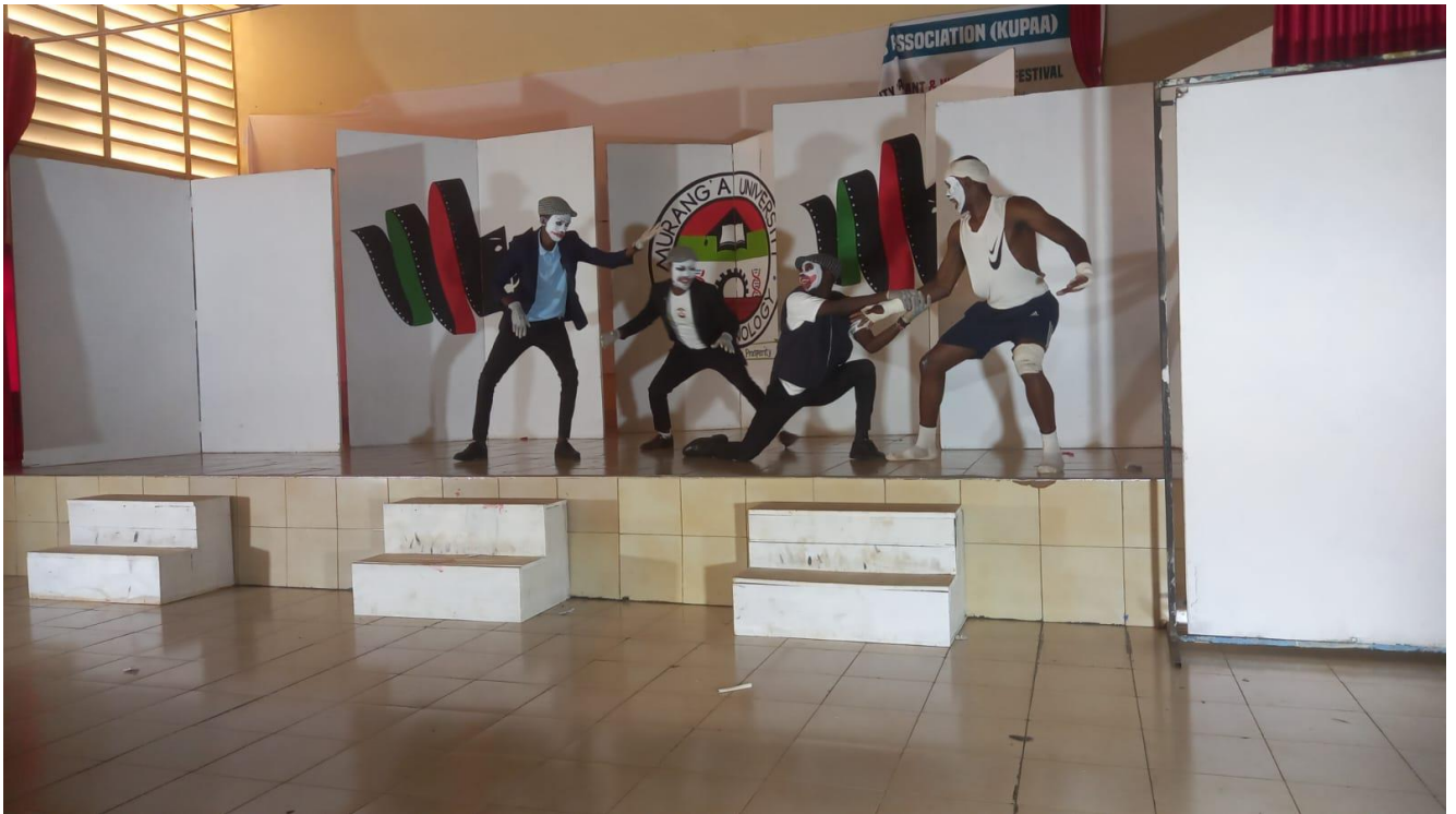
Group mime during the Central/Eastern Region Festivals