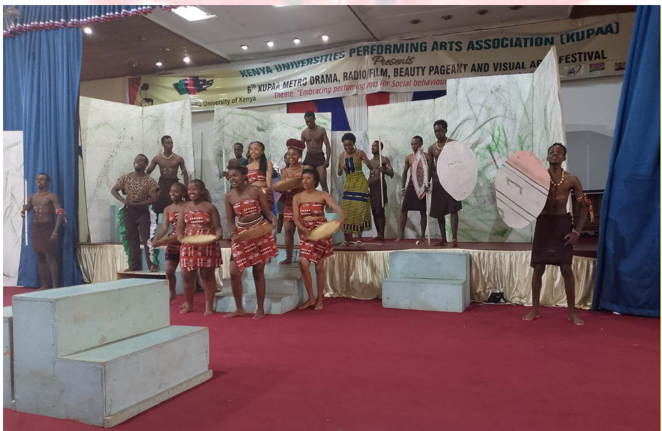
Historical play Gor Mahia during the Metro Region Festivals at Multimedia University of Kenya