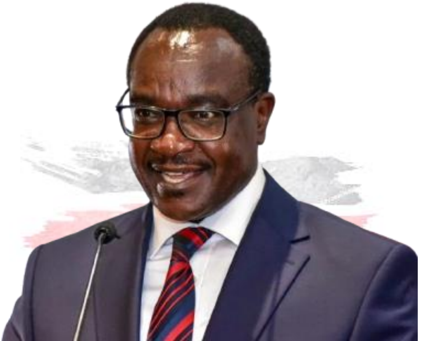
Hon, Julius Migos Ogamba Cabinet Secretary, Ministry of Education