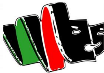
TUNA PAA NA KUPAA