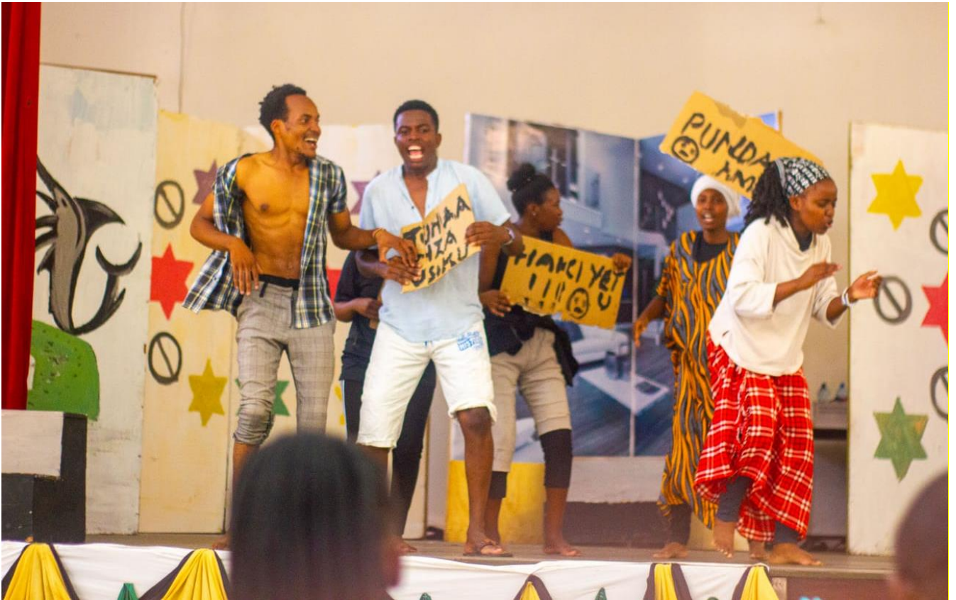
That is a play during the regional festivals at Lukenya University during the Coast/North Eastern regional festivals.